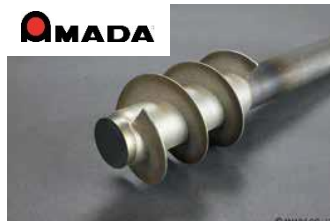
Screw-shaped additive Manufacturing (DED)