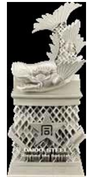
Shachihoko (Mythical carp)